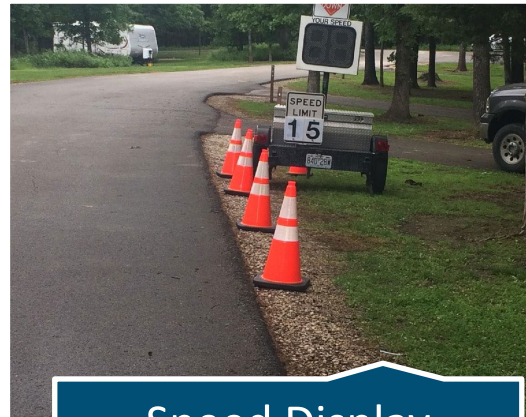
Speed Display Trailers