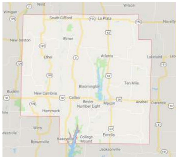
Figure 2.1. Map of Macon County and Location of Macon County in the State of Missouri