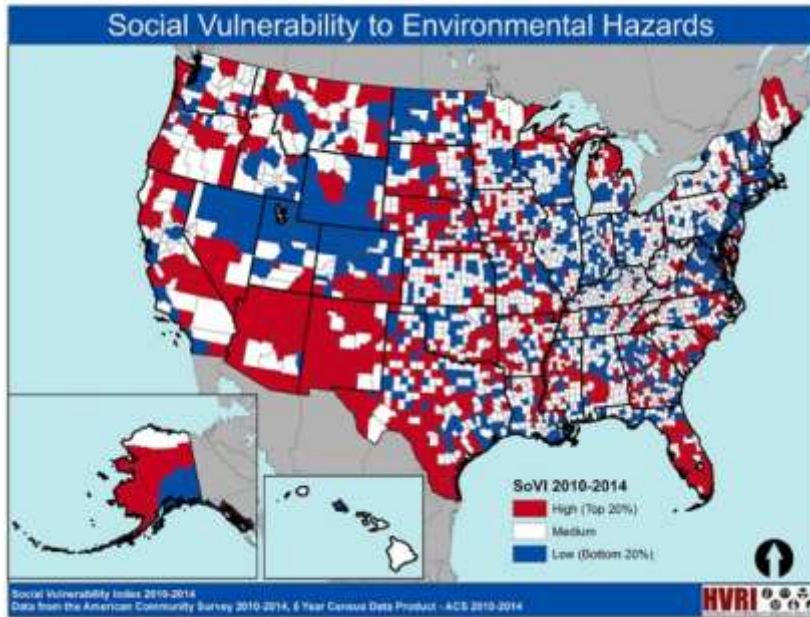
Figure 2.2. SoVI Data Sources Map