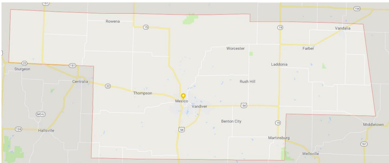
Figure 2.1. Map of Audrain County

According to the US Census, the population estimate for Audrain County as of the 2017 American Community Survey Estimates is 25,473 persons compared to the 2010 Census population of 25,529; a slight .22% decrease estimate in the seven year period. This decrease in population falls far behind the growth estimate for the State of Missouri for the same time period 2.30% and the Nation at 5.7%. According to the 2017 American Community Survey Estimates, Audrain County has experienced a 1.25% decrease in population since the 2000 Census.